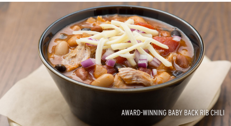
AWARD-WINNING BABY BACK RIB CHILI