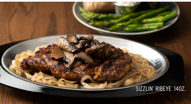
SIZZLIN' RIBEYE 14OZ.