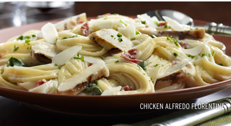
CHICKEN ALFREDO FLORENTINE