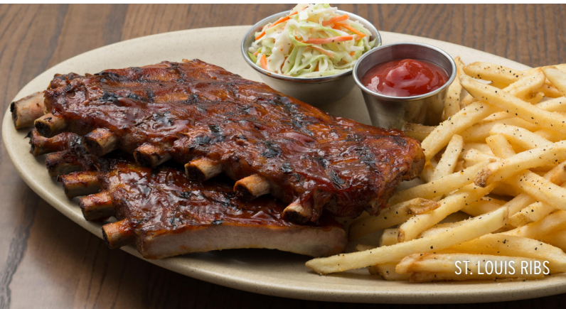
ST. LOUIS RIBS