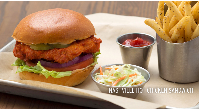
NASHVILLE HOT CHICKEN SANDWICH