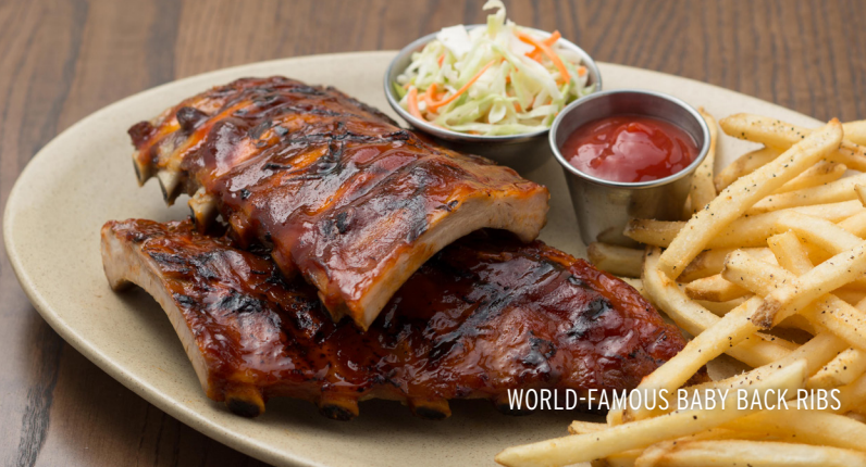
WORLD-FAMOUS BABY BACK RIBS