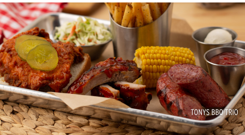
TONYS BBQ TRIO