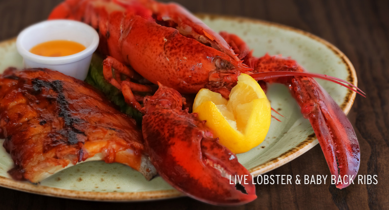
LIVE LOBSTER & BABY BACK RIBS