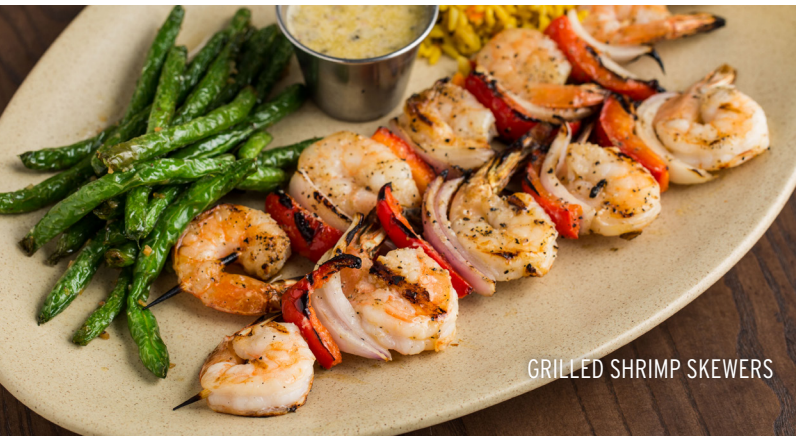
GRILLED SHRIMP SKEWERS