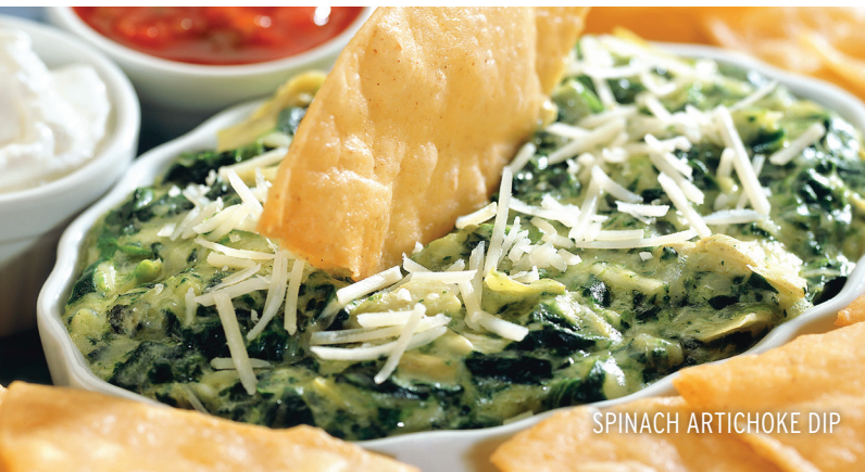
SPINACH ARTICHOKE DIP