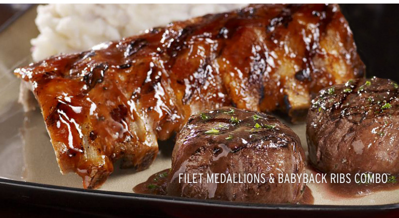
FILET MEDALLIONS & BABYBACK RIBS COMBO