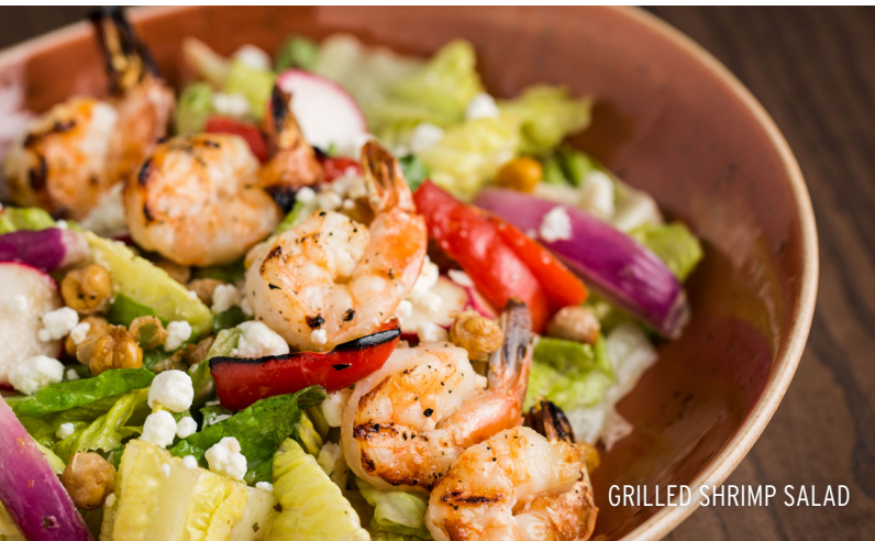
GRILLED SHRIMP SALAD