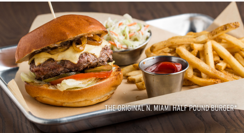
THE ORIGINAL N. MIAMI HALF POUND BURGER*